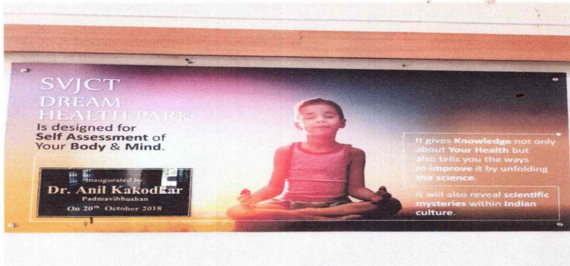
The Dream Health Park of SVJCTS