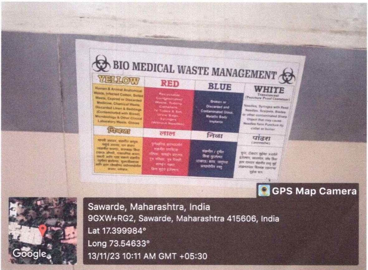
Liquid waste management

Sawarde, Maharashtra, India 9GXW+4H7, Sawarde, Maharashtra 415606, India Lat 17.398158° Long 73.545728° 13/11/23 10:28 AM GMT +05:30