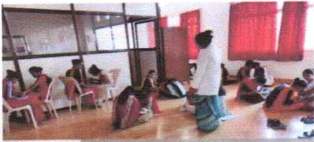
Samarth Nursing College Kasarwadi Sawarde, Maharashtra, India Kasarwadi Sawarde Maharashtra India 37°C 99°F 2023-03-03(Fri) 11:34(AM)