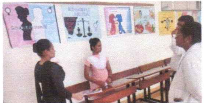
Samarth Nursing College Kasarwadi Sawarde, Maharashtra, India Kasarwadi Sawarde Maharashtra India 2023-03-01(Wed) 12:24(PM)