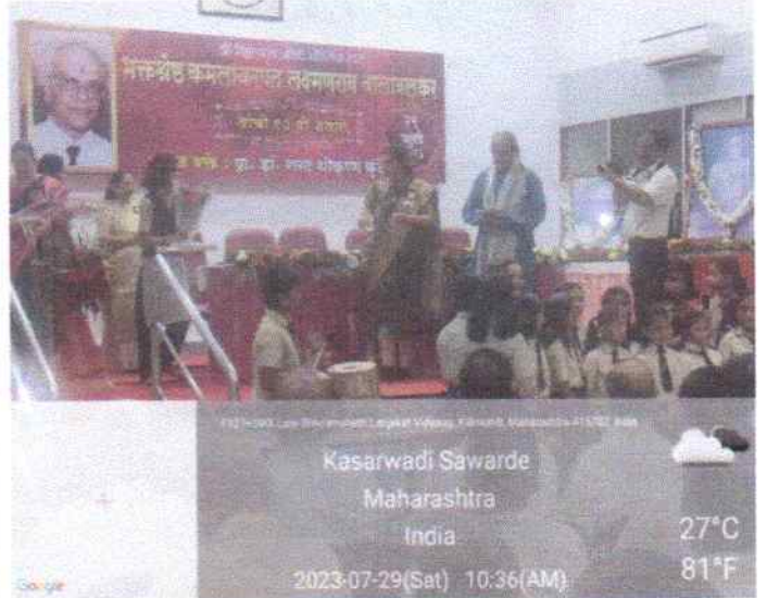
Kasarwadi Sawarde Maharashtra India 2023-07-29(Sat) 10:36(AM) 27°C 81°F