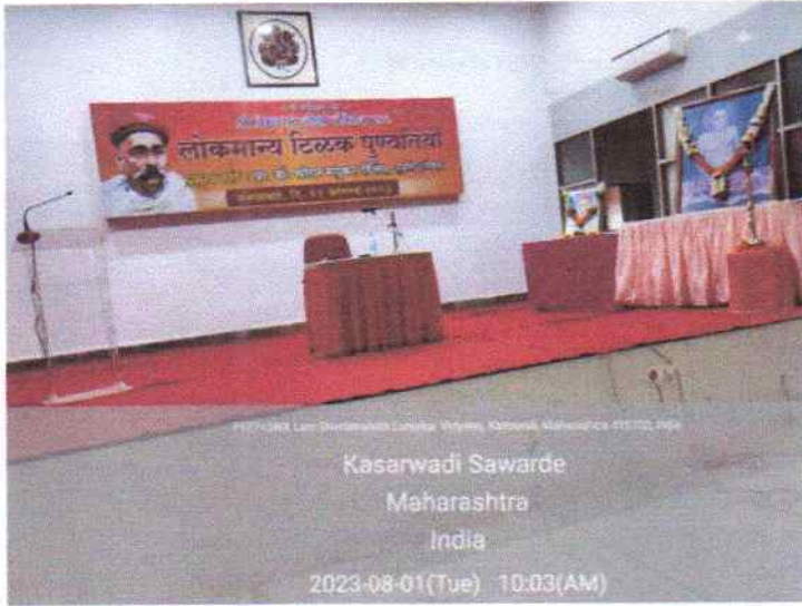
Kasarwadi Sawarde Maharashtra India 2023-08-01(Tue) 10:03(AM)