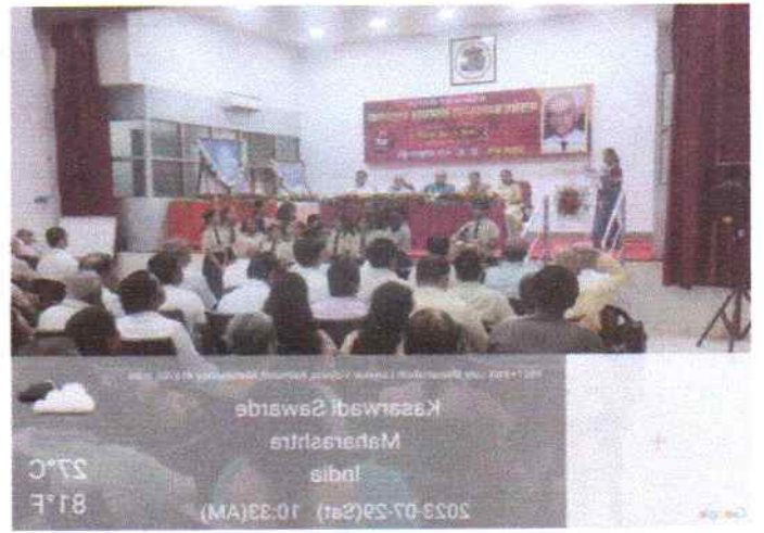
Kasarwadi Sawarde Maharashtra India 2023-07-29(Sat) 10:38(AM) 27°C 81°F