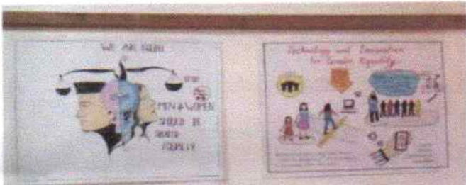
Samarth Nursing College Kasarwadi Sawarde, Maharashtra, India Kasarwadi Sawarde Maharashtra India 2023-03-01(Wed) 12:08(PM)