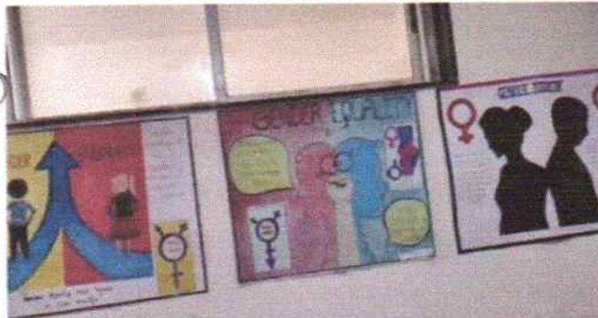
Samarth Nursing College Kasarwadi Sawarde, Maharashtra, India Kasarwadi Sawarde Maharashtra India 2023-03-01(Wed) 12:07(PM)