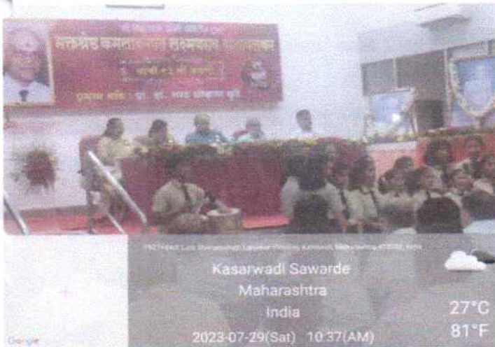
Kasarwadi Sawarde Maharashtra India 2023-07-29(Sat) 10:37(AM) 27°C 81°F