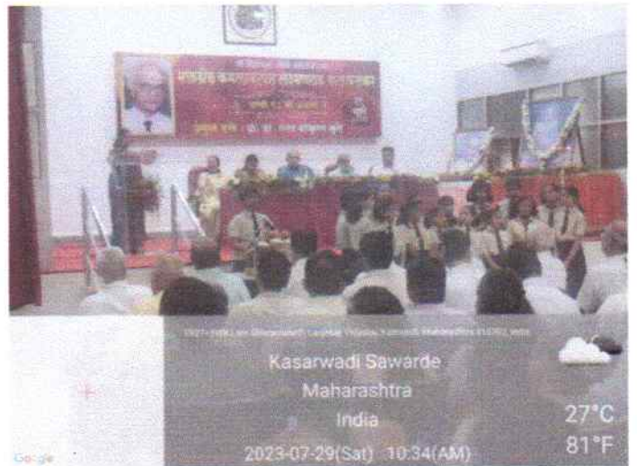
Kasarwadi Sawarde Maharashtra India 2023-07-29(Sat) 10:34(AM) 27°C 81°F