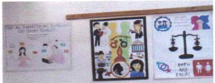
Samarth Nursing College Kasarwadi Sawarde, Maharashtra, India Kasarwadi Sawarde Maharashtra India 2023-03-01(Wed) 12:08(PM)