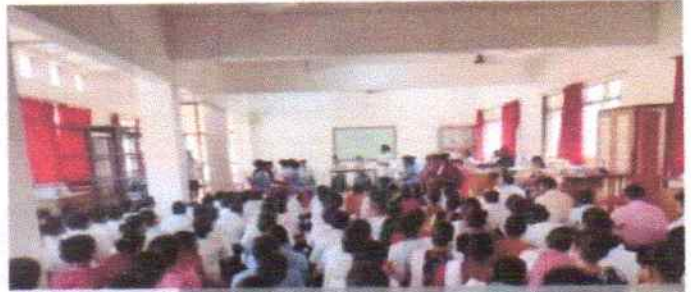
Samarth Nursing College Kasarwadi Sawarde, Maharashtra, India Kasarwadi Sawarde Maharashtra India 38°C 100°F 2023-03-02(Thu) 03:28(PM)