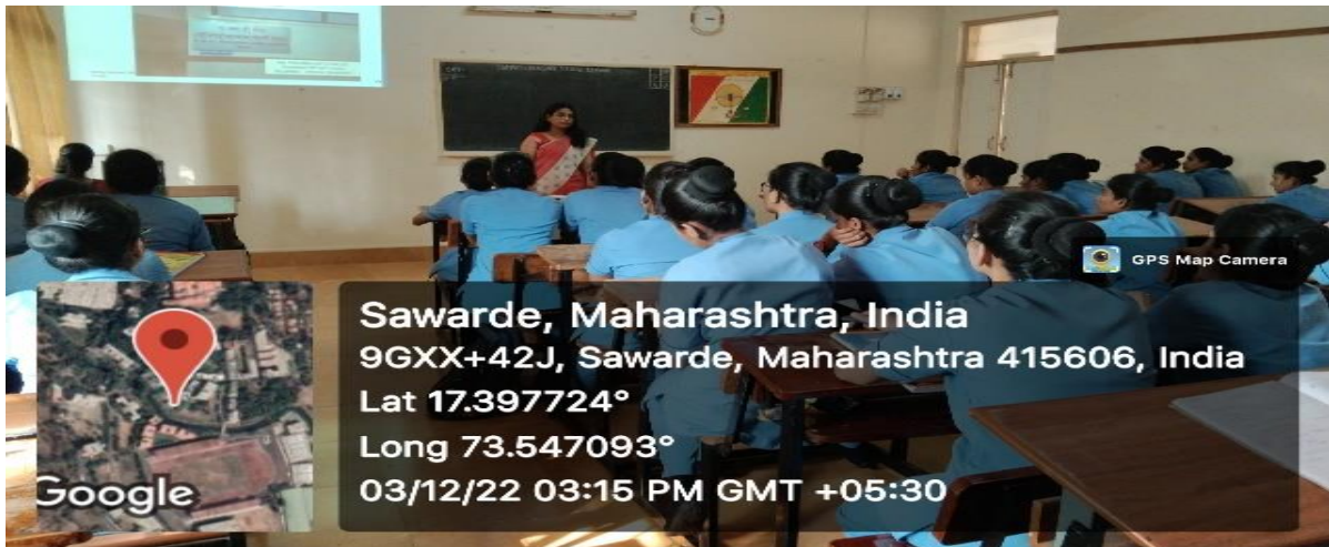
GNM 1 st Year (2021-2022) & GNM 2 nd Year