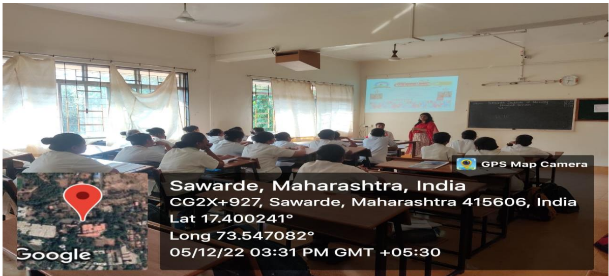
Basic BSc. Nursing 4 th Year