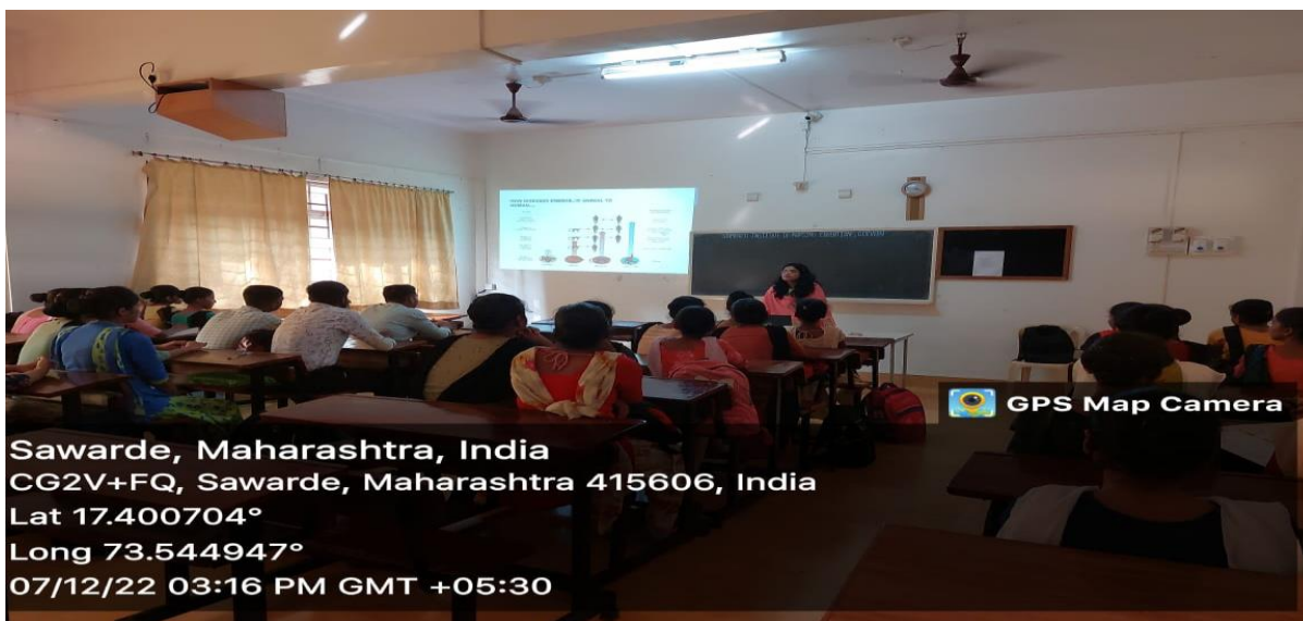
ANM 1 st Year & GNM 1 st Year